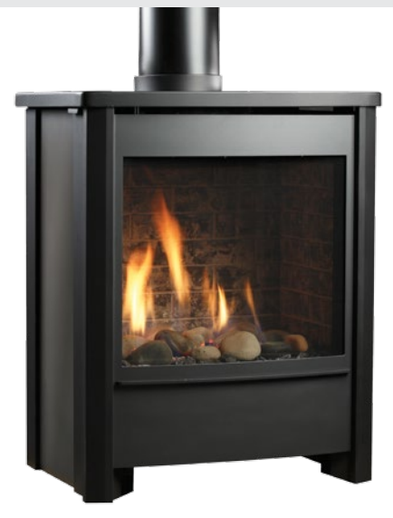
Unit illustrated is a FDV451N Free Standing Stove -Natural Gas, F450FBL Door Front - Charcoal with Black Posts, F451SDSBL Side Doors - Solid Charcoal Panel with Black Frame, MQG5C Bronze Glass (x3), MQROCK3 Rock Set - Multi-Colored, F451RLT Traditional Brick Liner, F45FK Fan Kit.

depth (max.) 71 1/2" height (min.) width (min.)