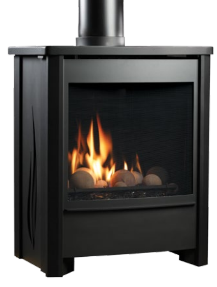
Unit illustrated is the FDV451N Free Standing Direct Vent Stove - Natural Gas, F450FBL Door Front - Charcoal with Black Posts, F451SDFBL Side Doors - Flame Panel Charcoal - with Black Frame, MQG5C Bronze Glass (x3), RBCB1 Cannonballs, F45LG Log Grate, F45FK Fan Kit.