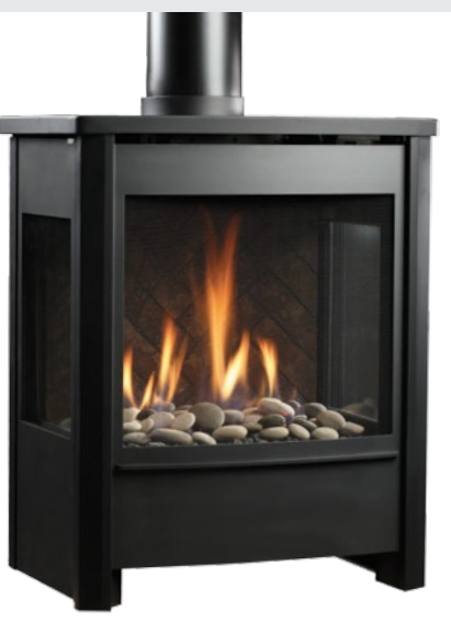
Unit illustrated is a MQFDV453N Free Standing Stove -Natural Gas, F450FBL Door Front - Charcoal with Black Posts, MQ453SDBL Side Doors with Black Frame and Charcoal Panel. MQG5C Bronze Glass (x3), MQSTONES Decorative Stones, MQ451RLH Herringbone Brick Liner, F45FK Fan Kit