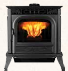
Matte black (standard)