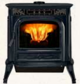
Porcelain dark blue