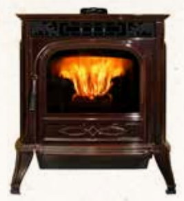
Porcelain majolica brown